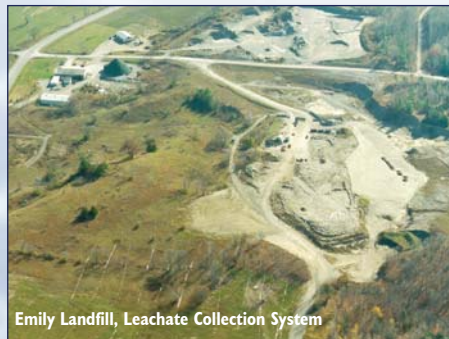
Emily Landfill, Leachate Collection System