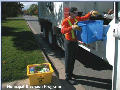
Municipal Diversion Programs