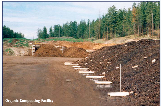
Organic Composting Facility