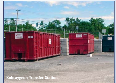
Bobcaygeon Transfer Station