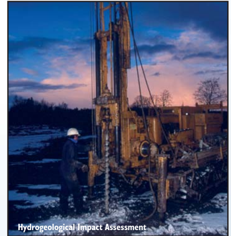
Hydrogeological Impact Assessment